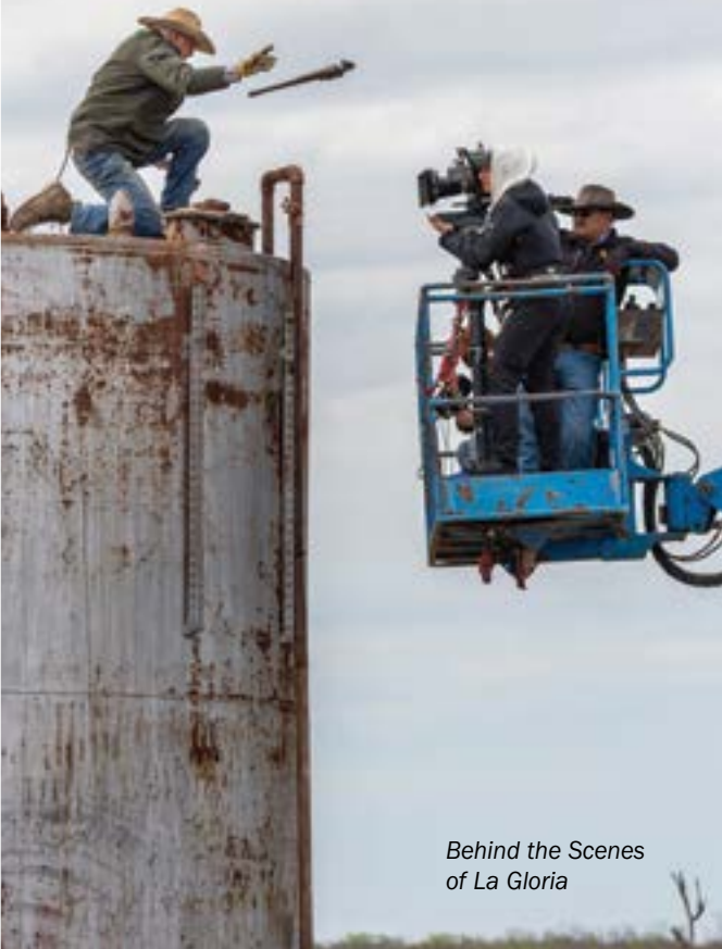
Behind the Scenes of La Gloria