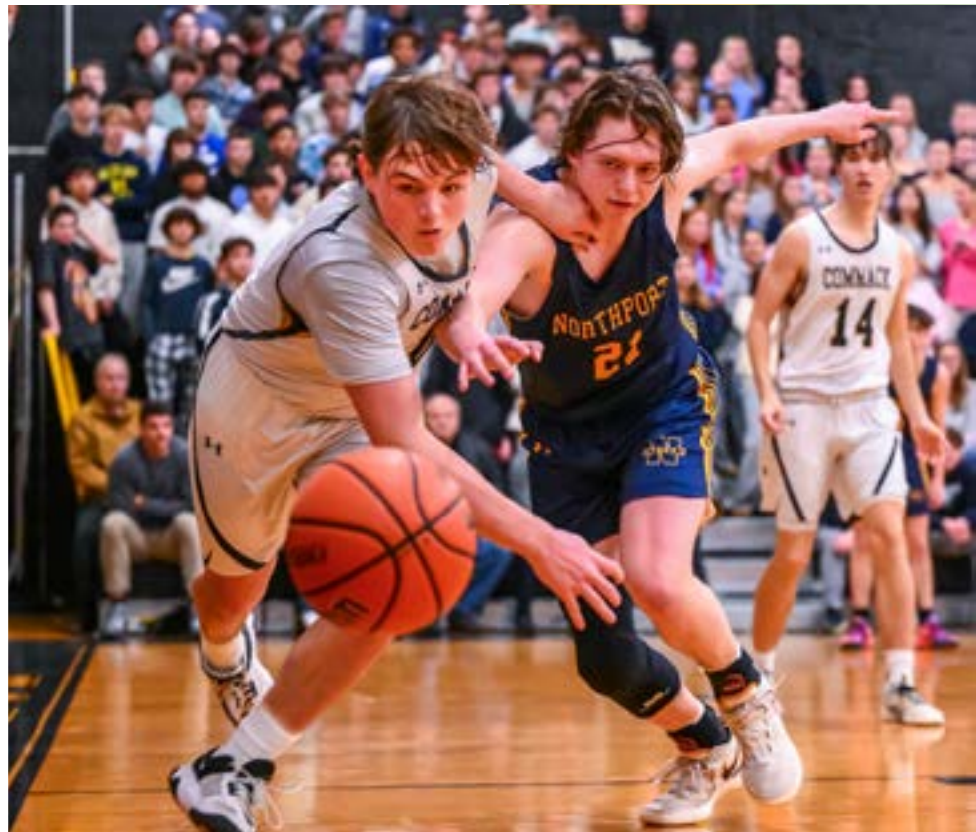
Top right: The first-place winning photo. Above: the second-place winning photo.

Held since 1982, the PCLI awards ceremony has recognized excellence in Long Island journalism for over 40 years and they hand out several scholarships to high school content creators. The Stony Brook Statesman won gold for Best College Newspaper and The Stony Brook Press won top prize for Best Magazine — an award that is open to all Long Island publications, professional as well as student-run