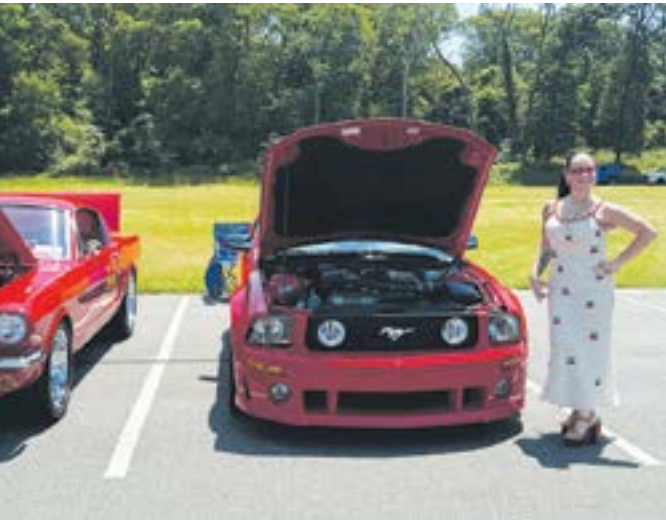
Left: Sports cars parked next to each other. Middle: A motorcycle featured at the show. Right: A guest at the stands in front of a red Mustang.