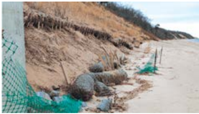
Bluff base west of the concrete Phase 1 lower wall showing destroyed coir logs, as at March this year.

The report emphasizes the need for permanent drainage landward of the club building and reconfiguration of the current building drainage system