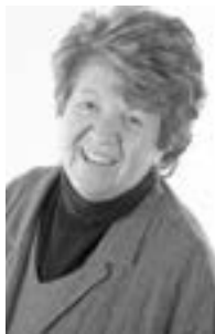
Between you and me

Whew! That was blistering heat we just endured for the last few days. When it gets that hot, I have two reactions. I need some ice cream, preferably a cone filled with coffee ice cream dotted with chocolate chips. And I have to switch to wearing shorts.