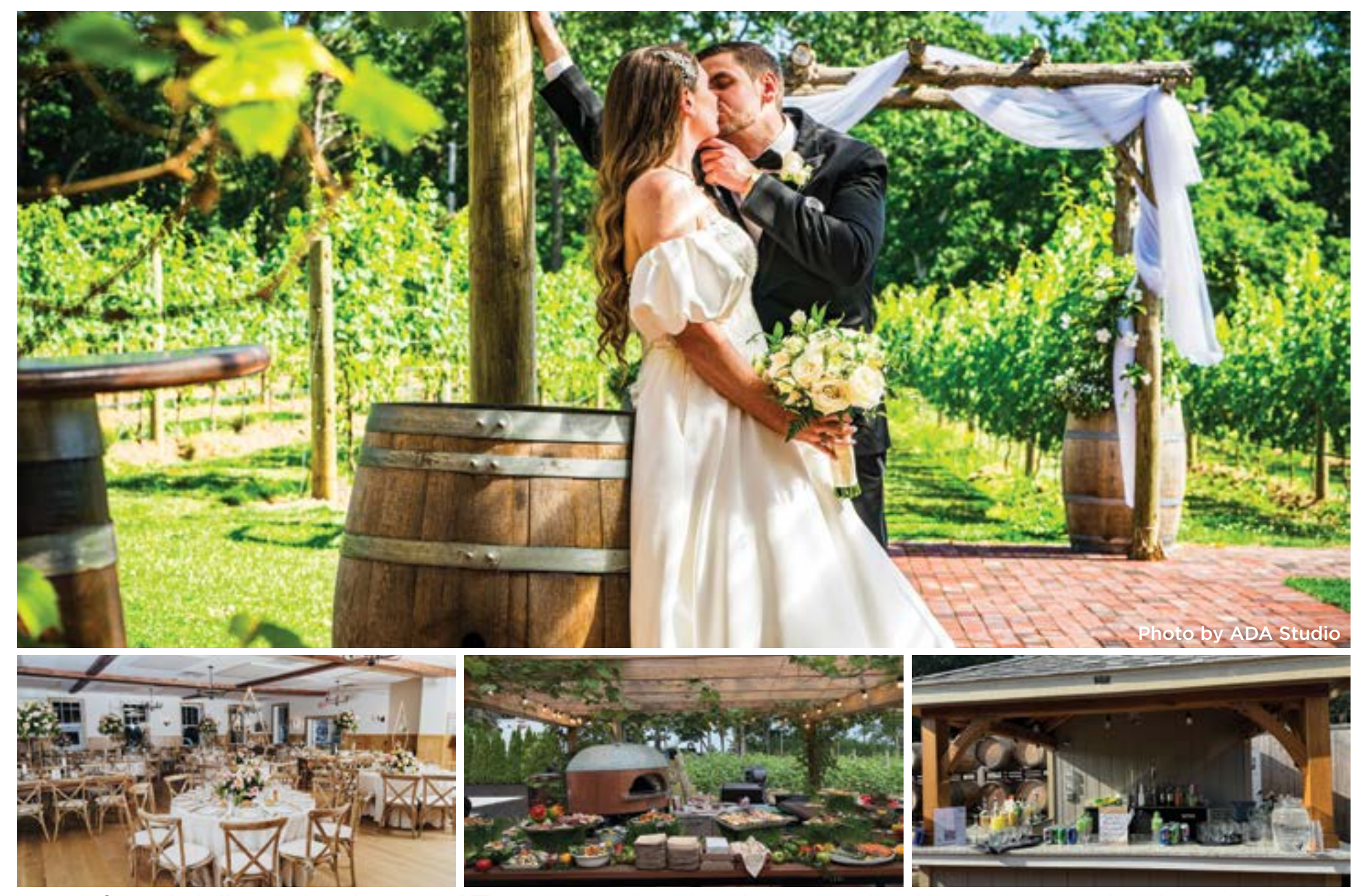
Say "I do" among the vines! Then unwind with a lavish cocktail reception under the arbor. Enjoy this beautiful outdoor setting with no site fee.