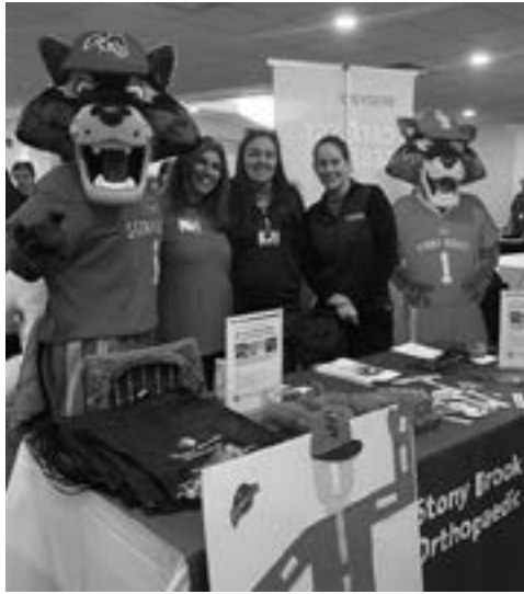
Scenes from the Port Jefferson Health & Wellness fest.

The event also was not limited to only organizations or businesses traditionally associated with health and wellness: everyone from the Port Jeff Free Library to Port Jeff Bowl to, Moloney Family Funeral Homes had a table set up, seeing the event as an opportunity to “put their name and face out there.” However, many of these groups used the event to highlight health-related services they offered that were less well-publicized, such as the Port Jeff Free Library’s “huge range of programs, from nutrition facts to stroke awareness, to a workshop on knee and shoulder pain.”