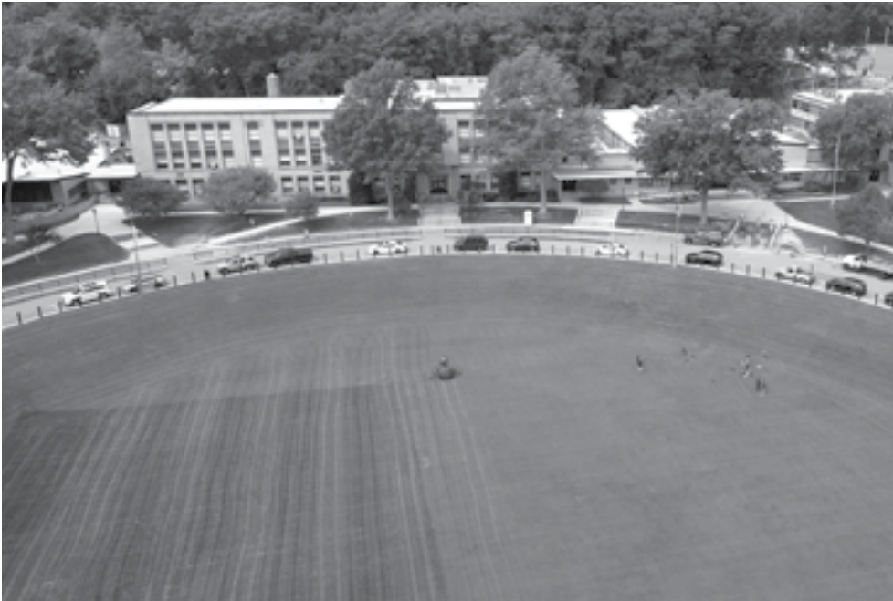
Drone photo taken by students attending the Port Jefferson School District’s drone camp.