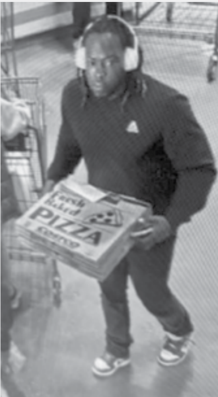
Do you recognize this man?