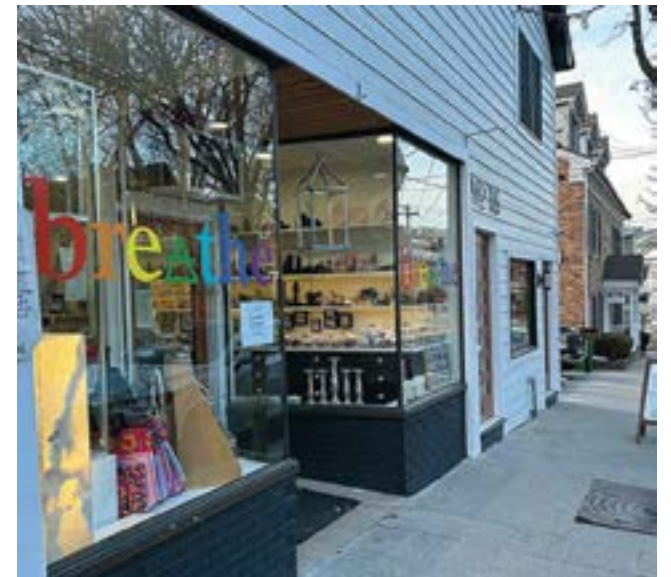
Port Jeff Salt Cave, The Wellness Stop and Breathe in the village of Port Jefferson.

Health & Wellness continued from B10 Jefferson Village.