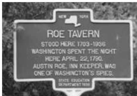
Roe Tavern location marker.

was defeated by British and Hessian soldiers at the Battle of Long Island, New York City and Long Island were occupied by the enemy. Washington and the Continental Army were fighting elsewhere, in upstate New York, New Jersey, Pennsylvania, and in the South. British headquarters was in New York City.