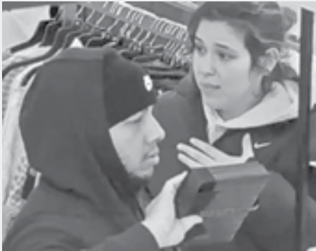
Do you recognize this couple?