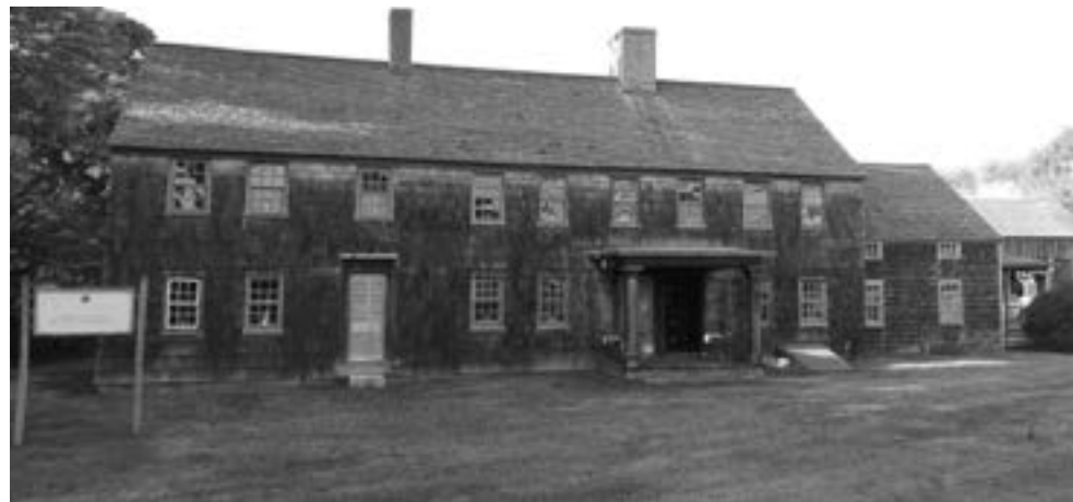
Ketcham Inn in Center Moriches.