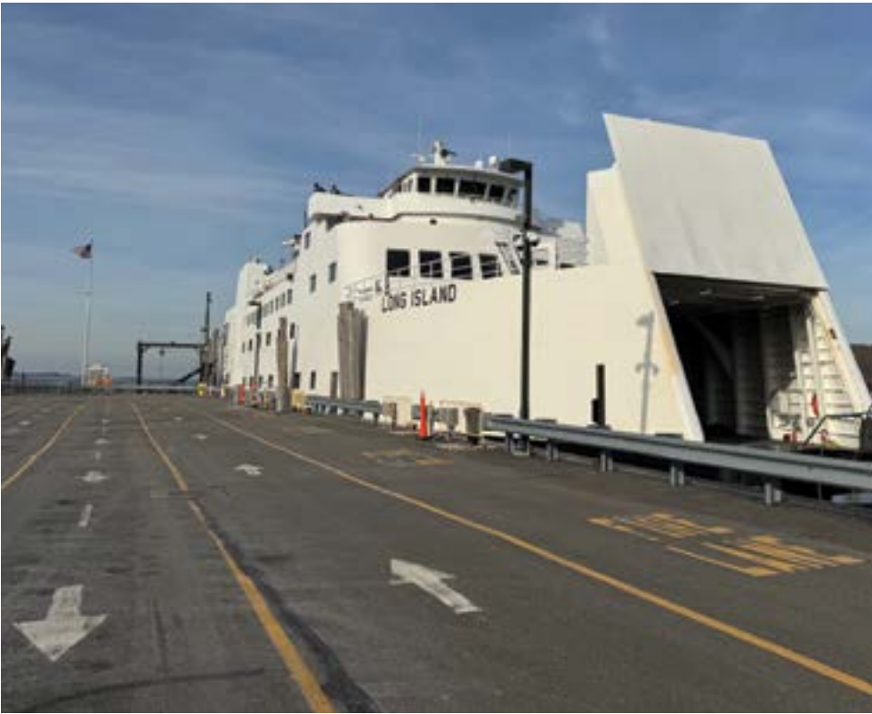
The Long Island.

allows Hall and the company to pursue ventures besides the simple transit to and from Bridgeport. Hall said that years ago the company used to plan excursions to other locations, such as Playland Park in Rye, an overnight trip to Albany or a trip down the Connecticut River. With an extra boat, this now may be possible. A fourth boat also alleviates the burden of demand. the company can only schedule three boats, but having a fourth reduces the inconvenience of delays in the case one of the others needs repairs or is out of commission. Further, Hall is exploring the possibility of using the fourth boat as a shuttle. In other words, if there is a surplus of vehicles waiting to board, and the scheduled vessel is at capacity, the fourth can serve as a shuttle to transport the remaining cars. “This is the huge benefit,” Hall said. “Everyone asks me when is your peak season. I’ve always said when the public schools aren’t in session.” He had meant summers, but has since realized that weekends are just as busy. “Our goal is to provide three-vessel service every weekend of the year. It is not going to happen 100% of the time. If you have four boats you have a better chance of providing three-boat service on the weekends consistently,” Hall said. Come down to the Port Jefferson Harbor and check out the new addition of the Long Island.