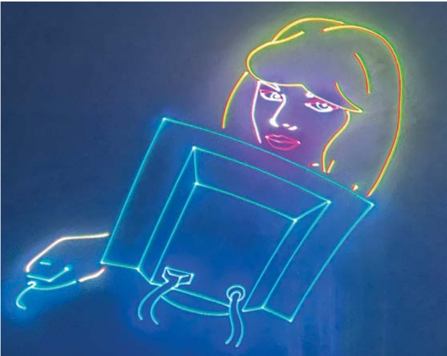
Various light displays depicting Taylor Swift, as well as other graphics.