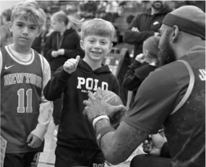
Scenes from the Harlem Wizards basketball game at Smithtown High School East.