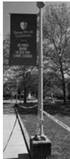
Yellow tape blocks off grass area nearby the early May protests.

"I am deeply saddened that we reached a point where police intervention became necessary. University administrators made every effort to avert this outcome. Nevertheless, I want to express my appreciation to all involved for the peaceful manner in which the events of yesterday evening unfolded.