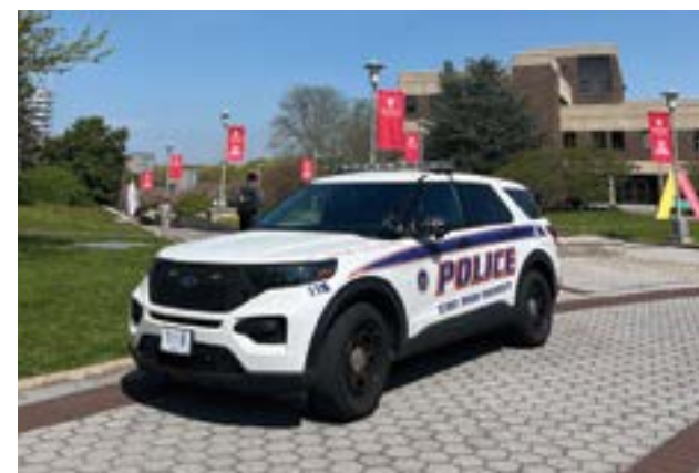
Stony Brook University Police posted around campus on Thursday, May 2.

The opinions of columnists and letter writers are their own. They do not speak for the newspaper.