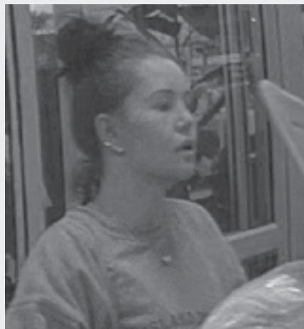
Do you recognize this woman?