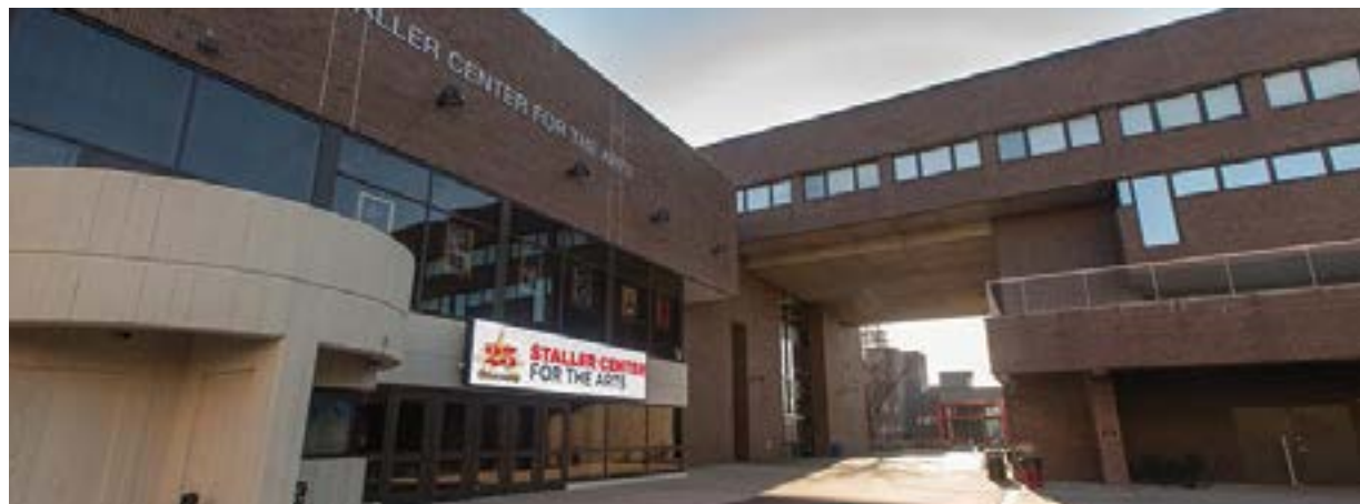
Stony Brook University's Staller Center for the Arts.