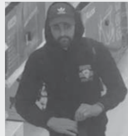
Do you recognize this man?