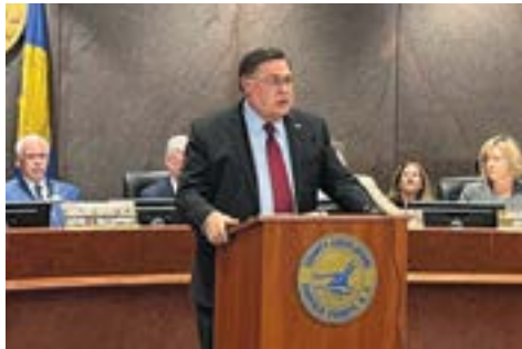
Fiscal responsibility to public safety County executive charts four-year plan for revitalization A8