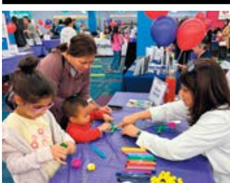
Middle Country Public Library gears up for Museum Day Also: Review of 'Unfrosted' B1