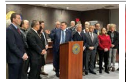
Clean water initiative Proposed sales tax increase to combat pollution