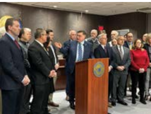
County Executive Ed Romaine stands before the podium at a press swimming water through new sewers and conference to announce the historic water preservation efforts move

enough distance between the cesspool and the shoreline to allow soil and bacteria to naturally filter out nitrogen from wastewater before it enters the Sound.