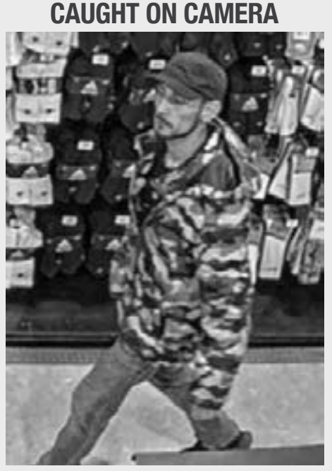
Do you recognize this man?

Visit www.tbrnewsmedia.com/police for more press releases from the Suffolk County Police.