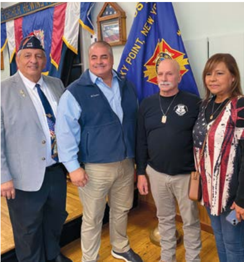
VFW Post 6249 in Rocky Point hosts its annual Veterans Day service on Saturday, Nov. 11.