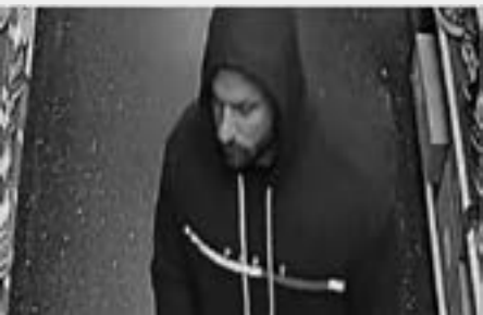
Do you recognize this man?

Suffolk County Crime Stoppers and Suffolk County Police Sixth Precinct Crime Section officers are seeking the public's help to identify and locate a woman who allegedly stole $300 worth of clothing from T.J. Maxx, located at 5125 Nesconset Highway in Port Jefferson Station, on October 19.