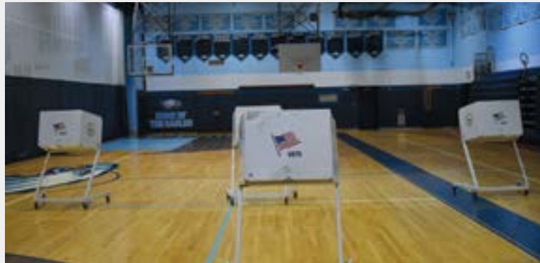
Voting booths at Rocky Point High School.

After the event, during which I handed out voter registration forms and voter information literature, I drove to the Suffolk County Board of Elections at 700 Yaphank Ave. in Yaphank. I was