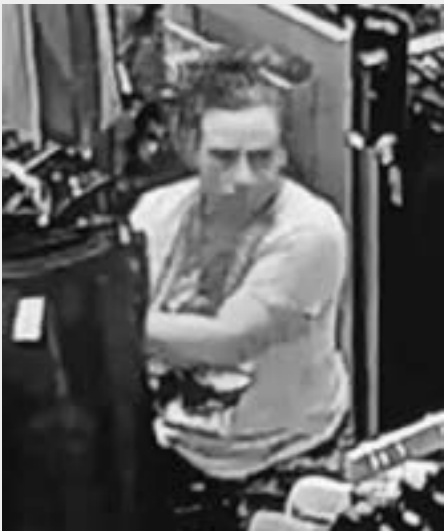
Do you recognize this woman?