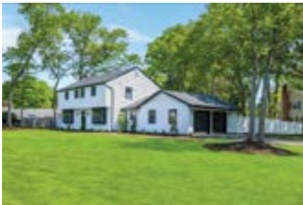
37 Pembroke Drive, Stony Brook Sold $775,000