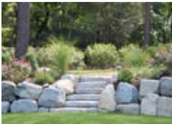
Stone & Gravel Materials