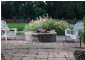
Pavers & Retaining Walls