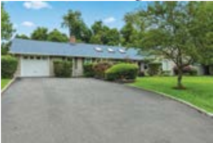
42 Acorn Lane, Stony Brook MLS# 3493871