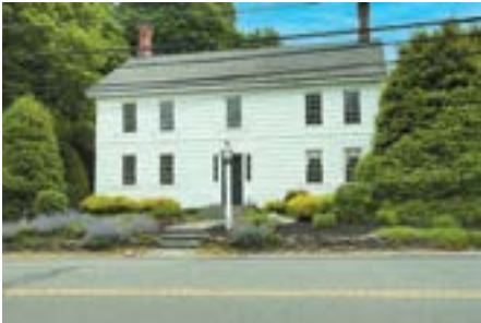
41 Main Street, Stony Brook MLS# 3483884