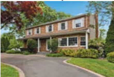
92 Darcy Circle, Islip Sold $800,000