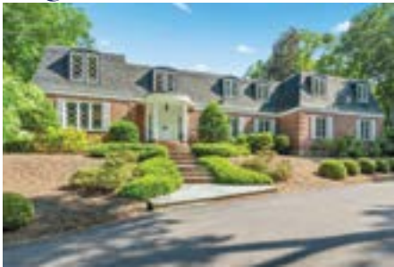
119 Mount Grey Road, Setauket $1,750,000 | MLS# 3480353