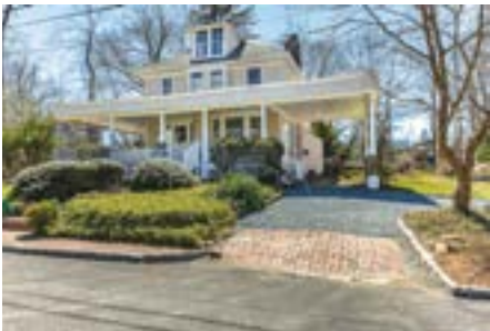
10 New York Avenue, Stony Brook Sold $750,000