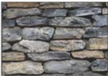
Brick & Stone Veneers