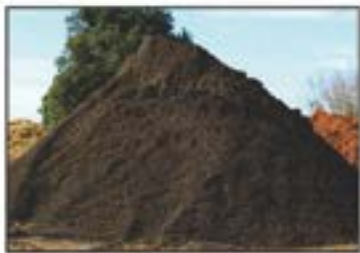
Topsoil & Mulch