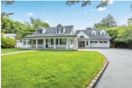
26 Beatty Avenue, Greenlawn MLS# 3485152