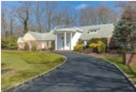
17 Wellington Drive, Stony Brook $1,100,000 | MLS# 3497408